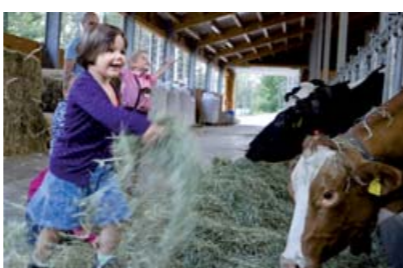
Alpenregion Bludenz Tourismus GmbH T +43.(0)5552.30227, F 30227-1712 info@alpenregion.at www.en.alpenregion.at

Three awe-inspiring alpine valleys - Brandnertal, Klostertal, Grosses Walsertal - and the alpine city of Bludenz make for the charm of this region. 800 km of hiking trails, 300 km of mountain bike routes, two 18-hole golf courses, horseback riding, and archery all await action-hungry visitors. For families: inspiring nature explorations, game worlds, supervised activities, festivals. "Enjoy nature without harming it" is the motto to which the Grosses Walsertal biosphere park subscribes.