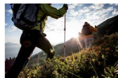
Montafon Tourismus GmbH T +43.(0)5556.722530, F 74856 info@montafon.at www.montafon.at/en

Genuine mountains. Genuine adventure. In the 39km long high-alpine valley and its 11 villages, the world's best fitness devices are right at your doorstep: real mountains, including Vorarlberg's highest peak, mount Piz Buin (3,312m). The Montafon has rich pickings for sports aficionados. Hiking historic trails, conquering mountains on an ebike, fine dining in alpine lodges or mountain forest adventures feature in the programme of activities just as much as awesome challenges for zealous hobby athletes.