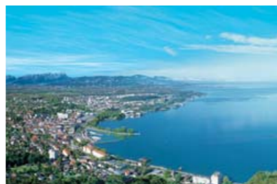
Bodensee-Vorarlberg Tourismus T +43.(0)5574.43443-0, F 43443-4 office@bodensee-vorarlberg.com www.bodensee-vorarlberg.com/en

A destination of choice for meetings and conventions, with Bregenz, Dornbirn, Hohenems and Feldkirch as main towns.