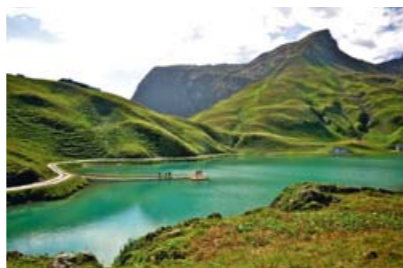
Lech Zürs Tourismus T +43.(0)5583.2161-0, F 3155 info@lech-zuers.at www.lechzuers.com

More time - more space Its reputation is legendary, its name stands for passion - the Arlberg. In Lech Zürs am Arlberg holiday-makers find "More space for their thoughts and more time for the senses". As a summer treat, the Lech Card is available free of charge for visitors staying one night or longer. Idyllic, leisurely, pampering: Stuben am Arlberg is lined by the Lechtal alps and the Verwall group; the laidback village of Klösterle enjoys a romantic setting against the foothills of the Arlberg mountain.