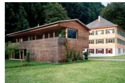
Bregenzerwald Tourismus +43.(0)5512.2365, F 3010 info@bregenzerwald.at www.bregenzerwald.at/en

The elegance of simplicity A region for connoisseurs who love the good things in life. Famed for delicious mountain cheese and the Käsestrasse (Cheese Route). An amazing mix of traditional and contemporary architecture. Themed trails which tell fascinating stories. An interesting cultural landscape which is ideally suited for any kind of outdoor activity. The Werkraum Haus in Andelsbuch showcases craftsmanship and artistry. Worth listening to: the Schubertiade Festival concerts in Schwarzenberg.